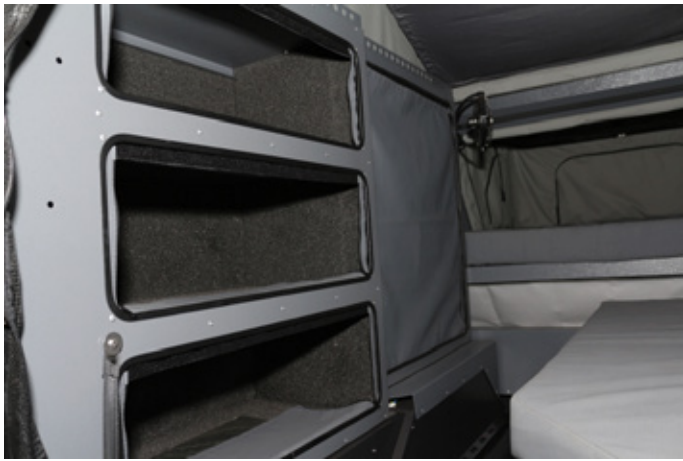
Three clothing cupboards large enough to pack travel suitcases and a small vanity cupboard. Inside access to kitchen cupboard.