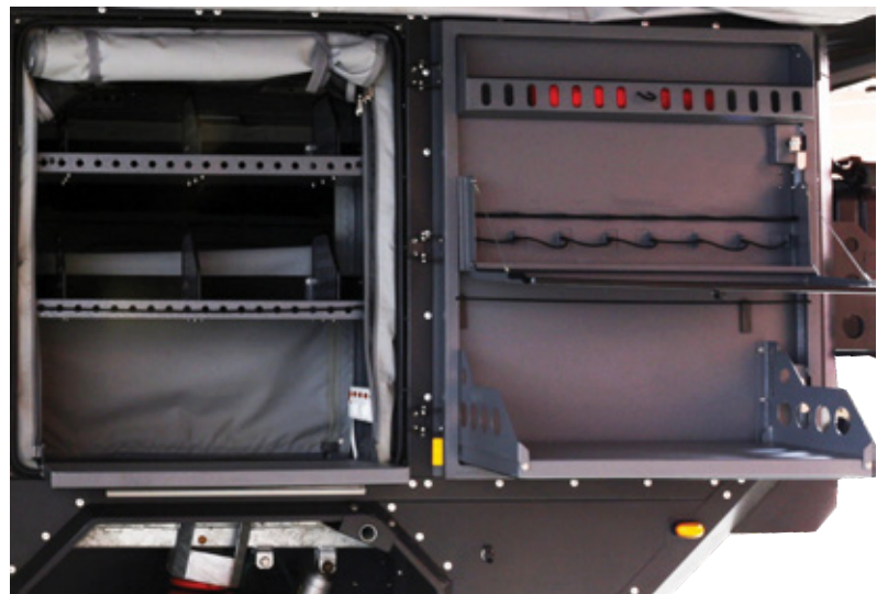
Large 315L Grocery Cupboard and work surfaces for those night and day time snacks.