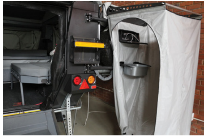
Quick set-up foldout shower with Hot & Cold water and washbasin.