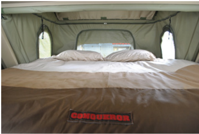
Large Comfortable Front Fold-out Double Bed