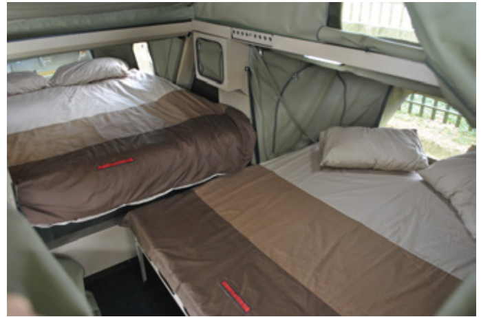
Side Fold-out Double Bed