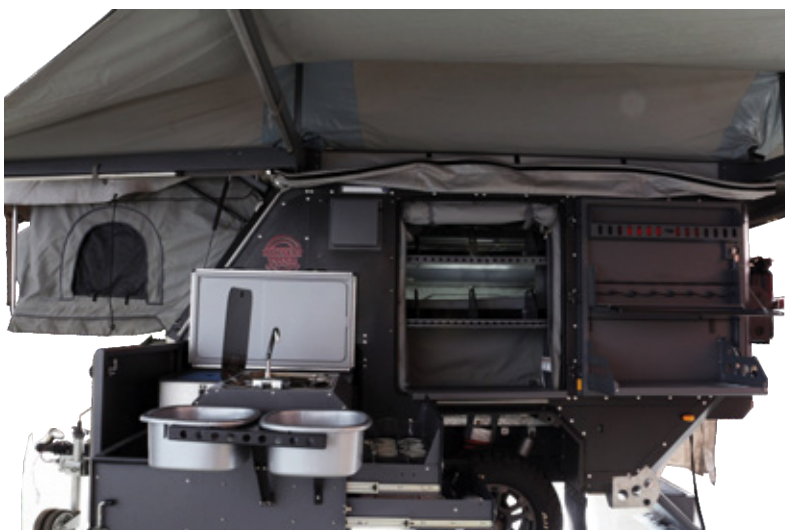
Perfectly laid-out Kitchen with easy to reach fridge, instant hot water wash-up facility and a large Grocery Cupboard with space for a microwave.

HOT DIPPED GALVANISED BOXED A-FRAME & CHASSIS