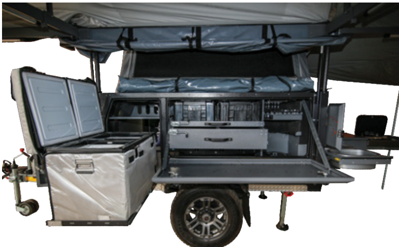
Perfectly designed kitchen. Large work area, loads of packing space and easy to reach fridge. Cooking is a social event not a necessity.

HOT DIPPED GALVANISED BOXED A-FRAME & CHASSIS