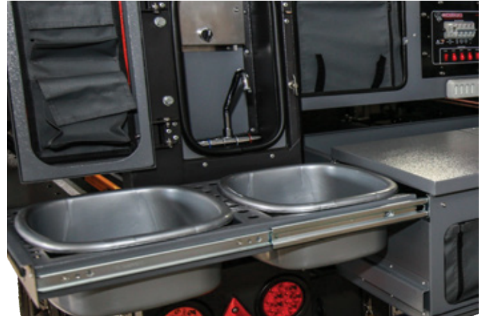
Slide out dual wash basin with instant hot water.