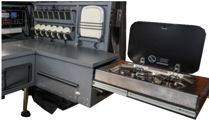
Slide out two plate gas burner, comfortable workings area. Everything has its place.