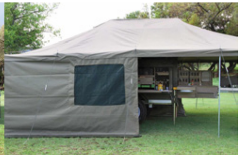
Ripstop Side Panels with window or doors