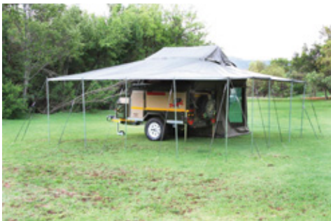
L-Shape PVC Awning

In a Conqueror Comfort no holiday is ever the same. Whether you enjoy touring, long stays or a quick weekend getaway we've got you covered. Our selection of awnings ranges from a large 7m x 7m awning, L-shape or kitchen awning to a uniquely designed Insta-Awn with integrated drop-down legs for quick and effortless setup.