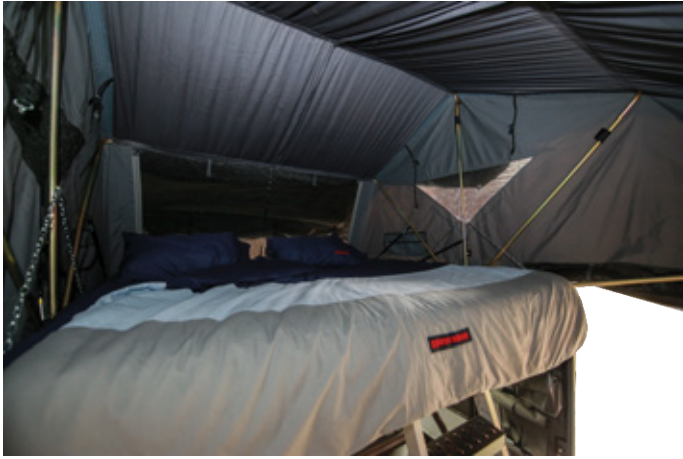
Large Comfortable King Size Bed. Sweat dreams await.