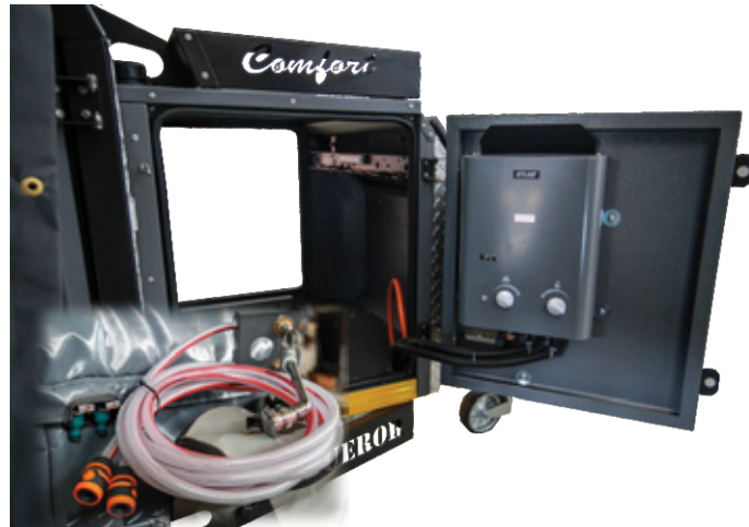
Instant on demand Hot Water Geyser with Shower Plumbing.