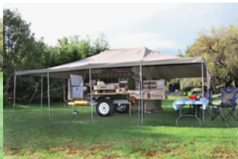
7 x 7 meter Ripstop Awning